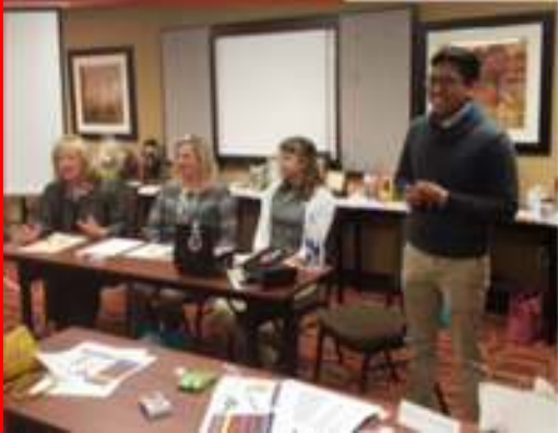
Luncheon speakers at the 2016 LWWKY Council in April.

The League of Women Voters of Kentucky Council, held April 8 and 9 was hosted by the Hopkinsville LWWV. Fourteen delegates from Lexington, Louisville and Christian and Hardin counties attended. Delegates